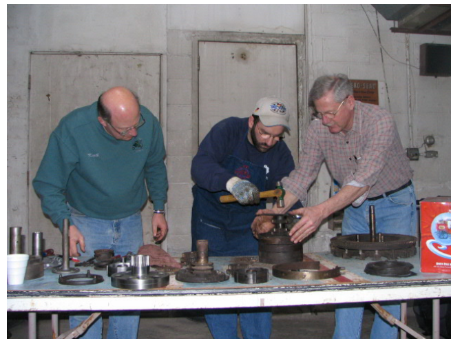
Locating problems with a front axle assembly The transmission goes back together